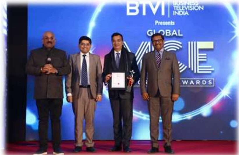
BEST 5 STAR LUXURY HOTEL OF THE YEA Taj Lands ,Mumbai