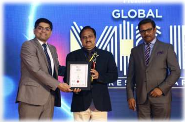
TOURISM LEADERSHIP AWARD Madhya Pradesh Tourism