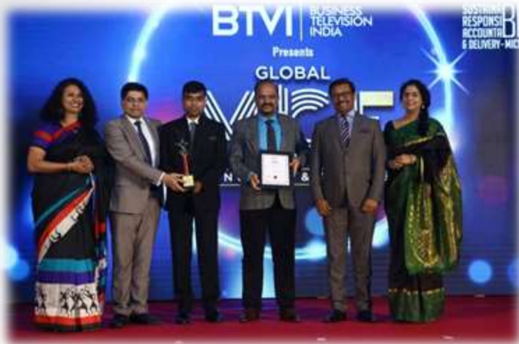
BEST OUTBOUND MICE OPERATOR OF THE YEAR COX & KINGS LIMITED