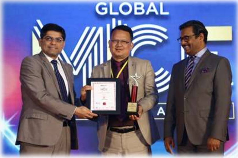
TOURISM LEADERSHIP AWARD Manipur Tourism