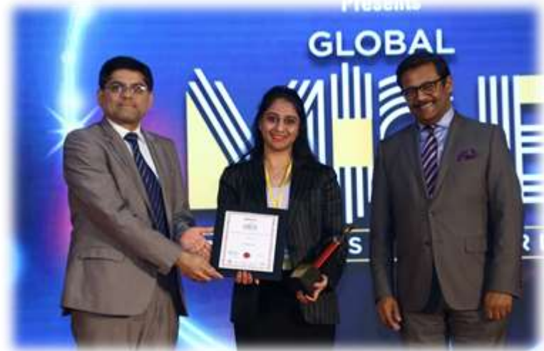
BEST WEDDING DESTINATION HOTEL OF THE YEAR The Corinthians Resort