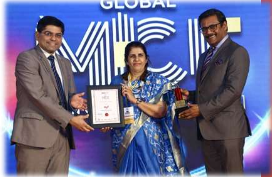
TOURISM LEADERSHIP AWARD Odisha Tourism