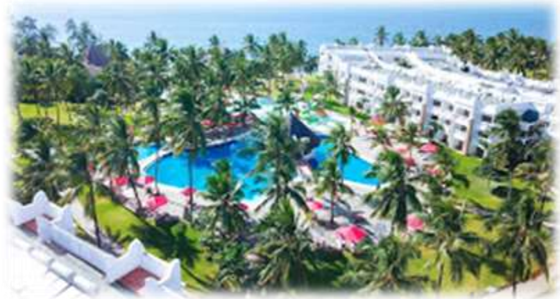
Best Convention Centre / Convention Hotel Of The Year Prideinn Paradise Beach Resort & Convention Centre